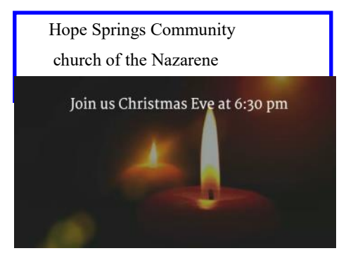
26:16 Church of the Nazarene