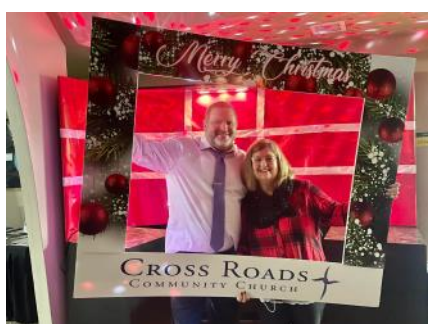
CHRISTMAS EVE CANDLELIGHT SERVICES Christmas Eve Candlelight & Communion Service Friday, December 24 at 5:00 p.m. Cross Roads Community Church 2400 N. Butler Ave.