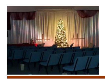
Lovington's Children's Christmas program